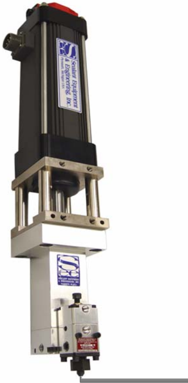
Servo-Flo 404 Shot Meter