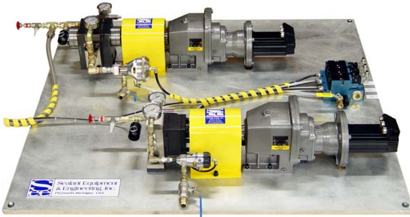
Servo-Flo 704-HV High Volume Gear Meter System Mounted on Base Plate