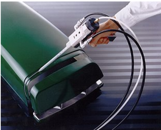
Manual Dispense Valve dispensing 2-Part Material

Easy to understand touch-screen allows you to set the exact flow rate and volume of mixed material